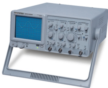
GOS-635G (35MHz) GOS-622G(20MHz)